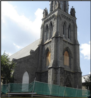
One of the numerous sanctuaries slated for demolition or « recycling » in the Montreal area.

In the province of Quebec, Christianity was discredited because its most preeminent institutional expression focused on being the guardian of public morality and stressed rituals at the expense of the nurturing of personal faith. This contributed to turn Quebec's society into a very secularized culture. Therefore, the vast majority of young Quebecers never really had the privilege to gain a solid understanding of what the Good News is about. With your help, we want to play our part in changing this.