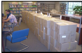
Stack of boxes containing the 4000 books

4,000 books stored in boxes laying on the floor of our library kept us company during spring. They contained the entire library of Institut Biblique VIE ,